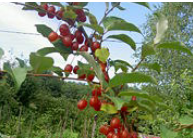
Goumi Eleagnus multiflora

'Snowdrop' & 'Pink Snowberry' - Zone 7. Sweet, tasty berries in the fall.