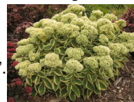
Sedum 'Lajos'