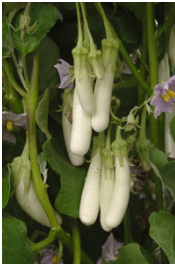
Eggplant 'Gretel'

'Sweet 100', 'Sweet Million' & new 'Tomatoberry' - Great cherry tomatoes.