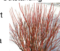
Cornus 'Arctic Fire'

'My Monet' - Totally unique bicolor. Ever changing foliage with rosy pink flowers. Compact.