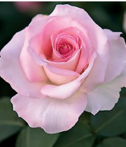
'Pink Promise'

'Pink Promise' - Pale pink. Sweet perfume. The official rose of the US National Breast Cancer Foundation.