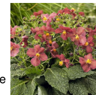
Verbascum 'Flower of Scotland'

Veronica 'Ulster Blue Dwarf' - Zone 4. Very long blooming dwarf with stiff spikes of deep blue-purple flowers.