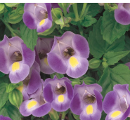
Torenia 'Catalina Series' - Blue'