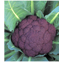
Cauliflower 'Violet Queen'

Tomato 'Tomatoberry' - A new patio type. Super sweet taste and aroma and they look like strawberries! High yield of 1/2 oz fruits.