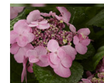
Hydrangea 'Endless Summer Twist-n-Shout'