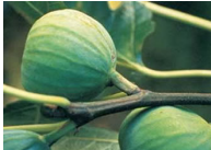
Fig 'Lattarulla'

'Stella' - Large red-purple sweet variety. Good for the Coast.