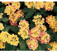
Lantana 'Luscious Series' Tropical Fruit'