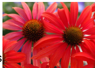
Echinacea 'Tomato Soup'

'Pinot Gris' - Ginger leaves with silver overlay & cream