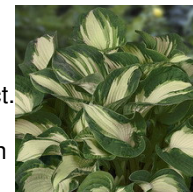
Hosta 'Golden Meadows'

'Lajos' - Zone 4. Variegated 'Autumn Joy' with bright