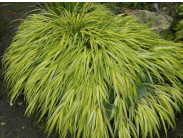
Hakonechloa macra 'Aureola'

Hakonechloa macra 'Aureola' A stunning grass with golden foliage spring to summer and pink highlights in fall. Cascading habit. Zone 5.