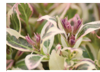
Weigela 'My Monet'