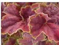
Heuchera 'Miracle'