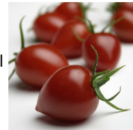
Tomato 'Tomatoberry'