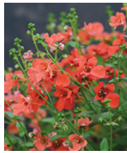
Diascia 'Flying Colours'

Goldsmith's 'Torrie' - All season. Proven Winners 'Catalinas Gilded Series' & 'Gilded Grape' - a new yellow.